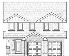
Optional Elevation Add $5500