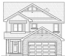
Optional Elevation Add $5500