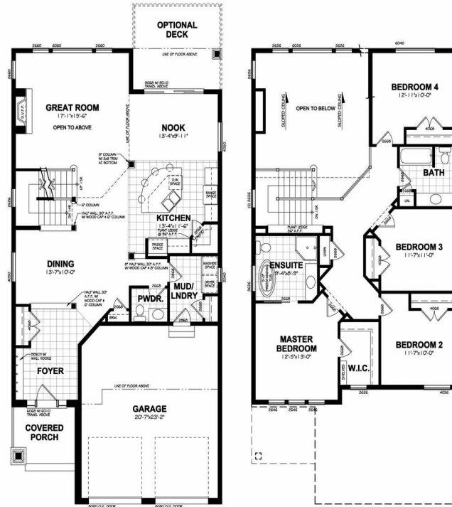
MAIN FLOOR PLAN 1213 SQ.FT.